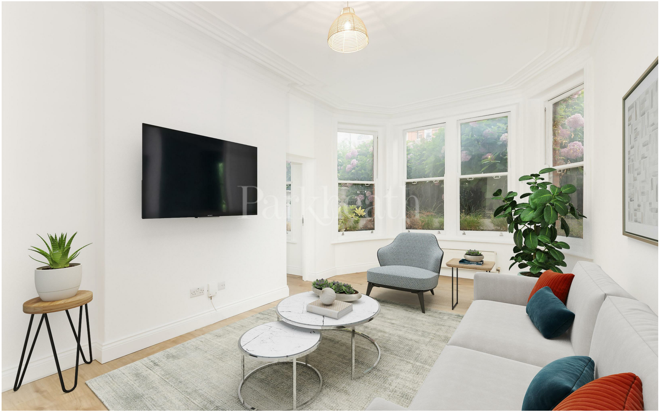
Canfield Gardens NW6